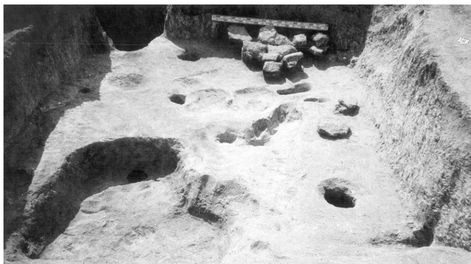
Fig. 2. Building Complex no. 6 in the excavation area "Osnovnoj". View from north.

The first of them, Building Complex no. 6, consists of the remains of a relatively large house of dug-out type of quadrangular plan, oriented N-S along its long axis, measuring 4.5-4.75 x 4.0 m, 1.1-1.2 m deep and with an area of about 19 m 2 (Fig. 1-2). The bedrock walls of this dug-out were even and upright, without any visible traces of destruction, suggesting that the pit was filled fairly quickly after its construction and all apparently on a single occasion.