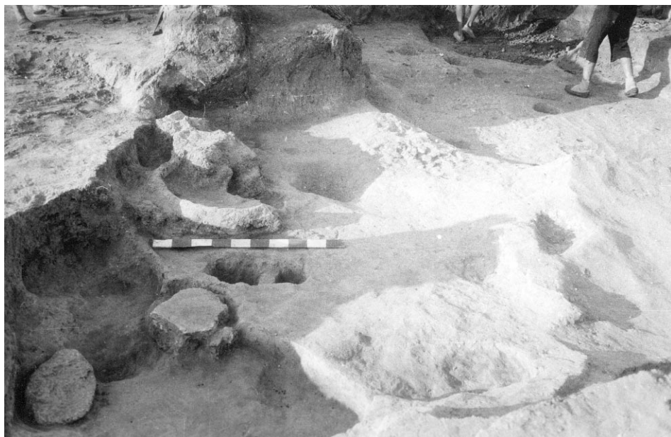
Fig. 3. Building Complex no. 13 in the excavation area "Osnovnoj".

most notable items found within the limits of the dug-out and which may in some way have been connected with its main function are, however, the 272 hardened splashes and ingots of copper with a total weight of 2.5 kg, and 187 pieces of various parts of ovens including one severely scorched tubular nozzle.