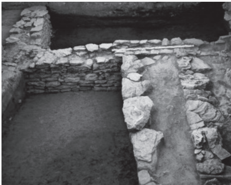
Fig. 5. Foundation of the staircase and gate-tower of the fifth century BC (view from the south).

urban territory here was occupied from the second quarter of the fifth century BC. The walls of the tower had a three-part structure with two armour faces constructed of coarsely hewn flattened blocks of limestone. The interstice between the faces was filled with densely packed clay mixed with fine rubble. The internal room probably served to house standing guards over the entrance to the city. The long-term presence of people here is suggested by a baked spot from a two-chambered rectangular fireplace measuring 0.6m by 0.55m which is preserved on the adobe floor in the southwestern corner of the tower. Above the level of the foundation of the fireplace, ashy intercalations up to 0.37m thick were noted. These layers, along with pieces of charcoal and fired bones of domestic animals, contained mussel shells and sturgeon scutes. Broken wares used for cooking and domestic refuse were thrown out – over the wall into the corner between the tower and the staircase. The base of the staircase was 5.4m long and about 2m wide. The four lower footsteps showed an incline at an angle of 30^\circ suggesting that the exit onto the upper platform of the gate-tower was at a height of about 3.5m. Its masonry was irregular with the limestone blocks laid flat and measuring on the face from 0.16m by