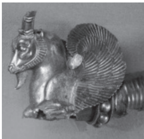
Fig. 3. Detail of the silver rhyton. Protome of a winged goat.

What was Labrys during the period when the independent Sindian Kingdom existed and the Semibratnee kurgans were constructed? The first excavations of the townsite, 28km northeast of the city of Anapa, were conducted by Vladimir G. Tiezenhausen as early as 1878, soon after he had finished his investigation of the nearby kurgans. Trenches sunk at the edges of the townsite revealed the remains of defensive structures about 3.2m high. However, the director of the excavations put forward no suppositions concerning their date, except to mention that a handle of a stamped Greek amphora and a corroded copper, probably Bosporan, coin were found during the excavations (OAK 1878-1879, 8-9). Regular investigations began there only 60 years later. These