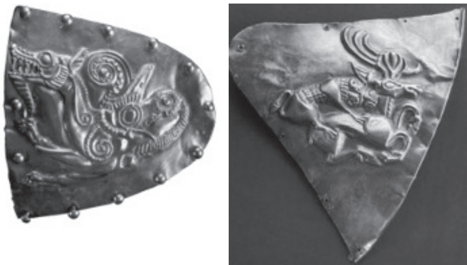
Fig. 4. Mounts decorating the edge of the horn part of the golden rhyton: 1 – depiction of a lion tearing a deer; 2 – depiction of a sennur.

were conducted during nine field seasons until 1955 by an expedition under Nikita V. Anfimov from the Krasnodar Museum of History and Regional Studies (Anfimov 1941, 258-267; Anfimov 1951, 238-244; Anfimov 1953, 99-111). It was established that the total thickness of the cultural deposits at the townsite extended to 3.3m. On the basis of the evidence yielded by excavations in the northern area, Anfimov dated these deposits as follows.