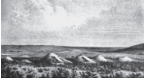
Fig. 1. Excavations of the Semibratnie (Seven Brothers) barrows. Lithograph of 1875.

worthy is the gracefully bent horn of the rhyton with broad horizontal flutes paralleled in Iranian art. The goat figure is rendered with the forelegs bent beneath the body, but the main attention of the artisan was focused on the head. The latter is separated from the neck by peculiar whiskers divided by parallel deep depressions. The eyes and eyebrows above them are represented in a stylized form. Beneath the eyes there are similar thin arc-like ledges reflecting the aspiration of the craftsman to render the head plastically within a single decorative scheme. The nostrils and mouth are clearly outlined, as is the wedge-like projection of the beard. The geometricity of the wings is intensified by the stylized treatment of the feathers. Between the horns and eyes, the mane is shown schematically in bulging relief lines, as on many Iranian rhyta (Marazov 1978, 54). Another motif typical of Achaemenid art is the strictly symmetrical positions of once fairly long horns. This fact additionally suggests a provenance in a region tied closely with the traditions followed by ancient Persian craftsmen. In this case, the traditional Indo-European image of a winged goat as a zoomorphic symbol of lightning and thunder must have complied with the tastes of the semi-nomadic Sindian elite.