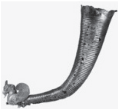
Fig. 2. Silver rhyton with the figure of a winged goat from the fourth Semibratniy tumulus.

It is difficult to judge how this precious object could have come to a Sindian ruler: as a trophy, a diplomatic gift or through trade (cf. Kisel' 1995, 44). However, it cannot be ruled out that it was simply included in the number of offerings regularly received by the king from the town situated 3km east of the Semibratniy barrows and which existed simultaneously with the lat-