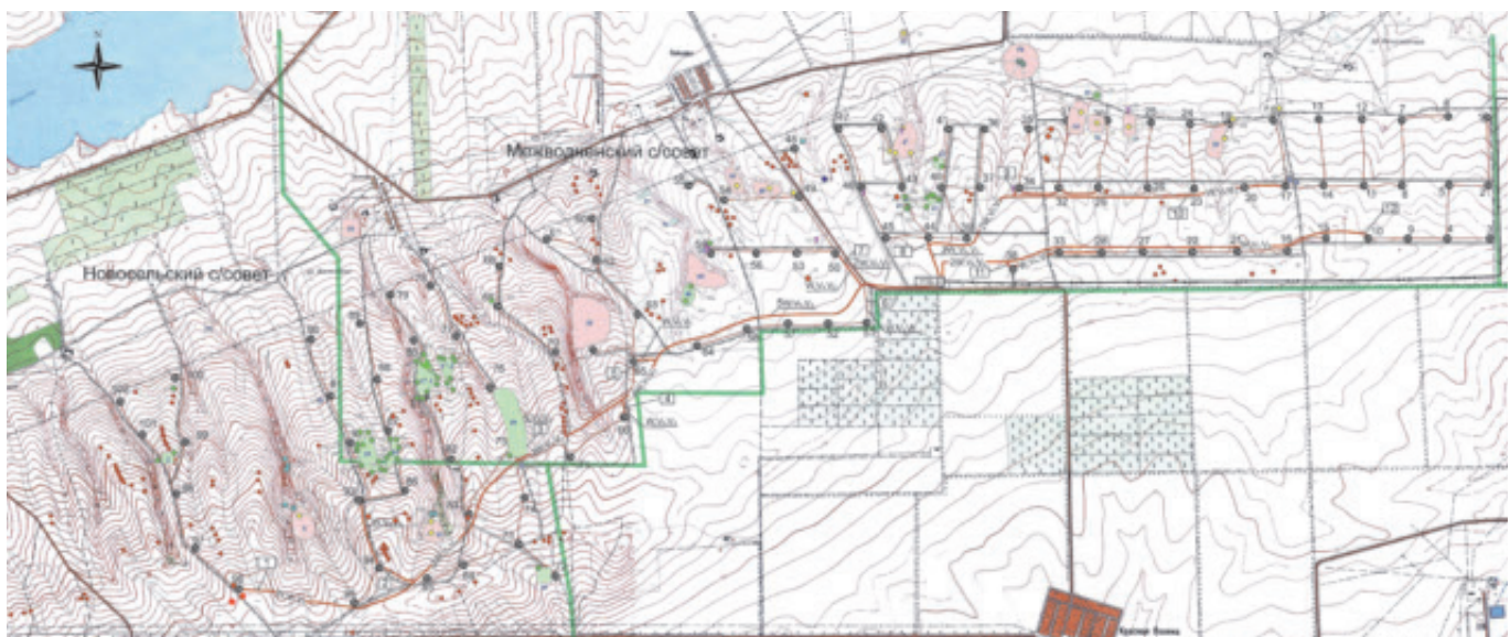
Fig. 0.4 • Map showing locations of proposed windmills for the wind power plant.