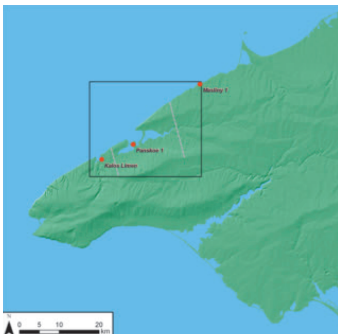
Fig. 0.2 • General map of the Tarchankut Peninsula.