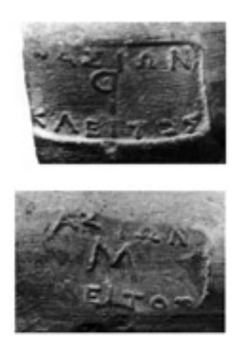
Fig. 2. The Thasian stamps of Kleitos from Panskoe I/ U7, horizon B.

are to be found in sub-groups B and C of Kac's MG IV respectively, which are now dated from c. 355 to the beginning of the 330s.<sup>33</sup> Close in time is the lower part of the Chian amphora with a conical toe found in room 117 of the aforementioned house (Fig. 3.1).<sup>34</sup> Fragments of similar toes are associated with one of the stamps of Kleitos found in courtyard 18 of the U7<sup>35</sup> and are datable to about 350 BC by analogy with the amphora from tumulus 26 (1911) in the necropolis of Elizavetovskoe.<sup>36</sup> Indicative also are the upper part of a neck<sup>37</sup>