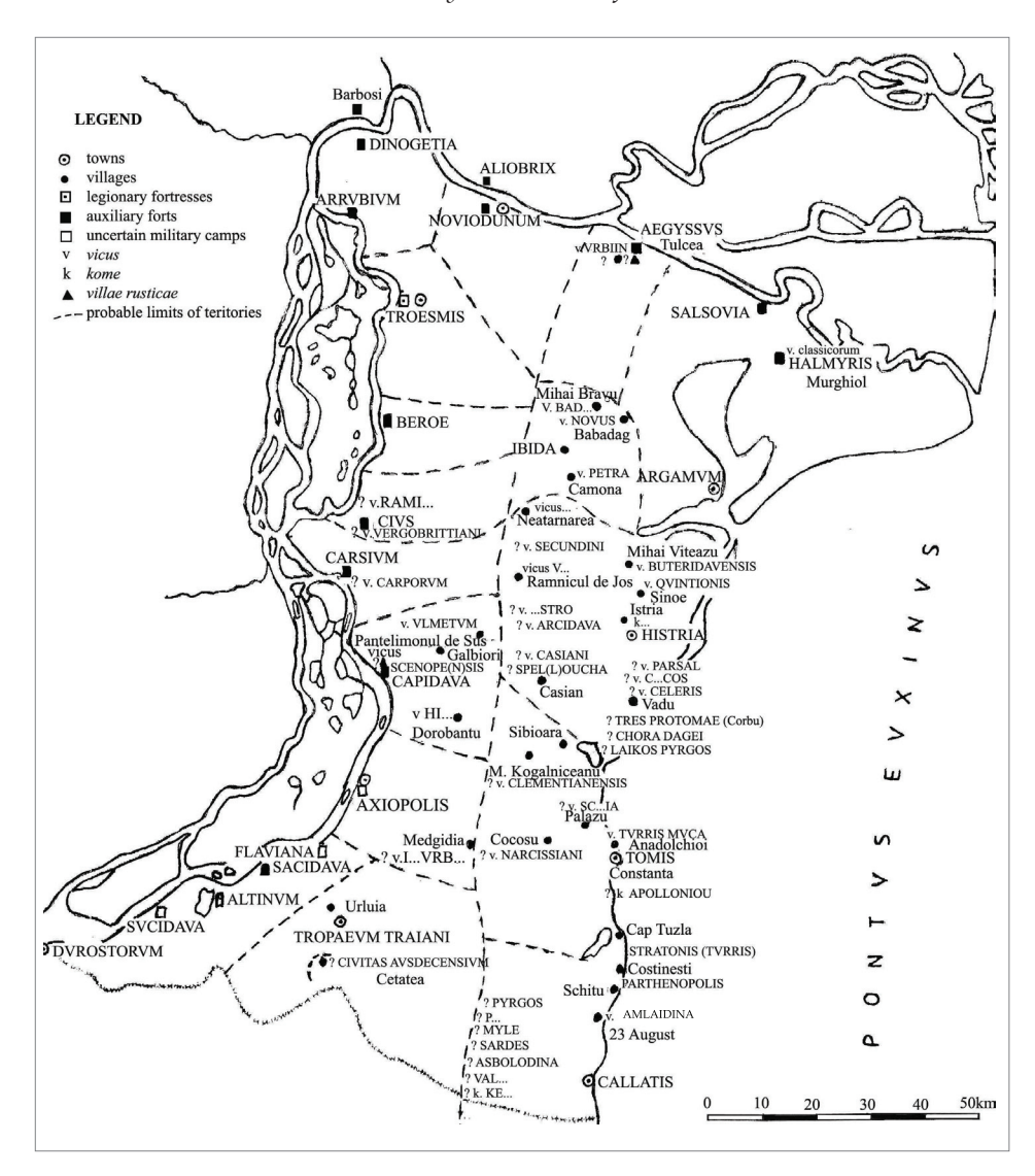
Fig. 1. The Roman Dobrudja (first-third centuries AD), after Bărbulescu 2001 with modifica tions.

many places and in fact in the past the Dacians had often taken advantage of this situation.