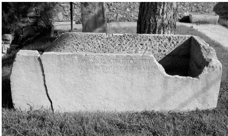
Fig. 1. The sarcophagus of G. Cassios Chrestos in Nikaia.

status in which he clearly took pride. His role as priest in the emperor's cult and his eagerness to honour the Roman governor are once again examples of public appearances in Roman contexts.