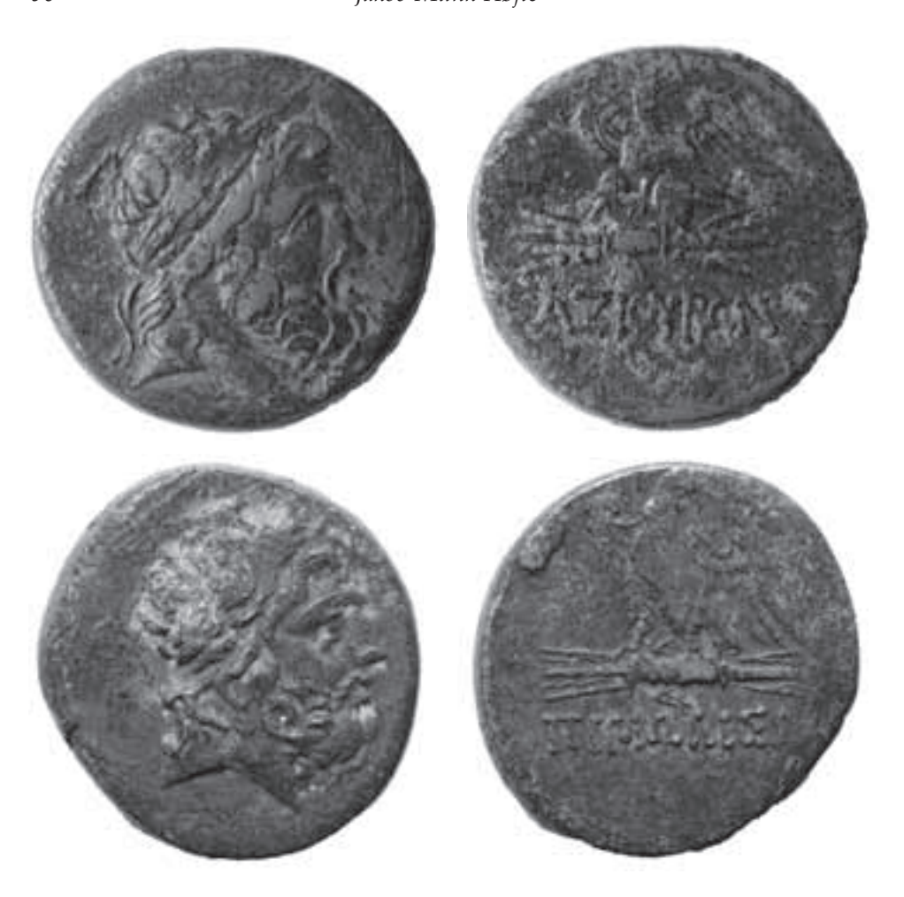
Fig. 1a-d. Zeus/eagle type bronze coins issued at: a-b) Gazioura, c-d) Pimolisa.

which he later himself destroyed because it had sided with the Romans. Zela already existed as a tempel state, and Strabon's remark (12.3.37) that in earlier times the kings governed Zela, not as a polis, but as a sacred precinct must simply mean that it lacked the political institutions of a Greek city. Diospolis was at the site of Kabeira, where Mithridates had built a palace, which in all likelihood was an urban centre as well. At any rate, the nearby temple state of Ameria had a large population (Strab. 12.3.31). Although it is at present impossible to tell exactly how developed these three cities were under the kings it would seem that the primary change was that they were given the institutions and constitutions of Greek poleis . Only Pompeiopolis, Megalopolis and Nikopolis, all on the periphery of Pontos, seem not to have been placed in already existing settlements. We must therefore consider whether there could be other explanations than the previous lack of such, as to why Pompeius