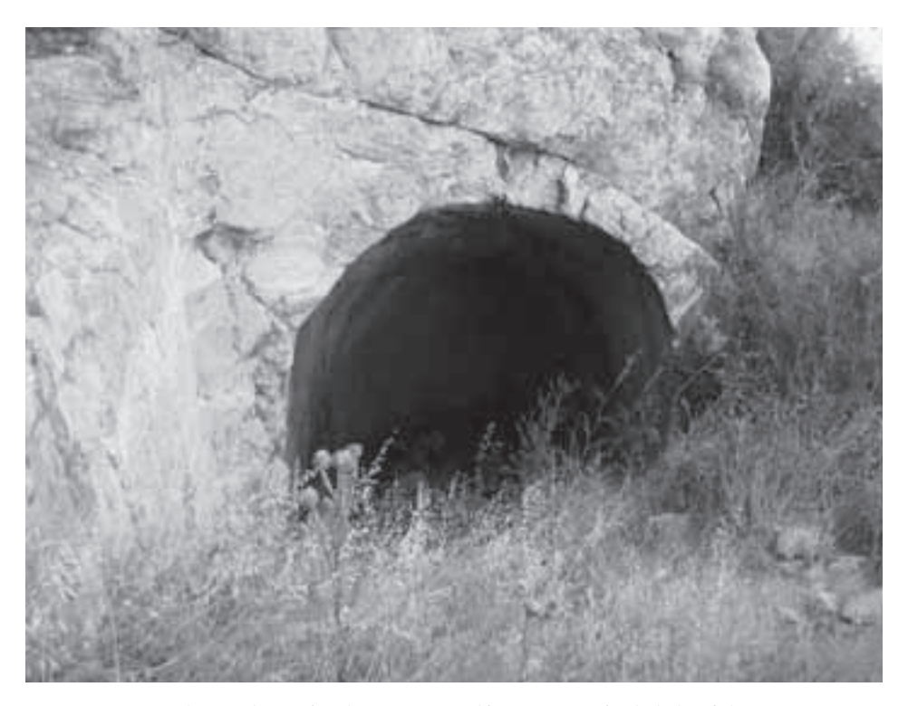
Fig. 4a-c. Stepped tunnels at: a) Tokat/Dazimon, b) Gazioura, c) Chabakta.